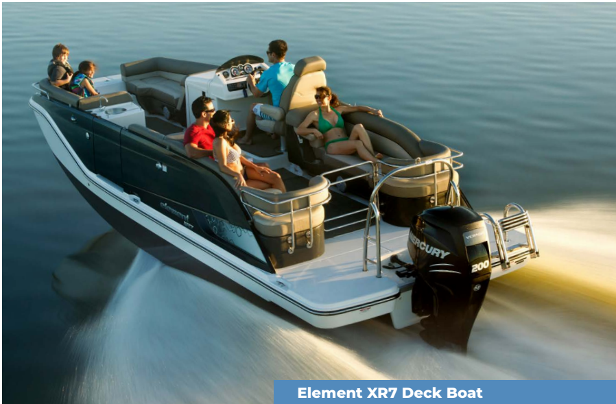
Element XR7 Deck Boat