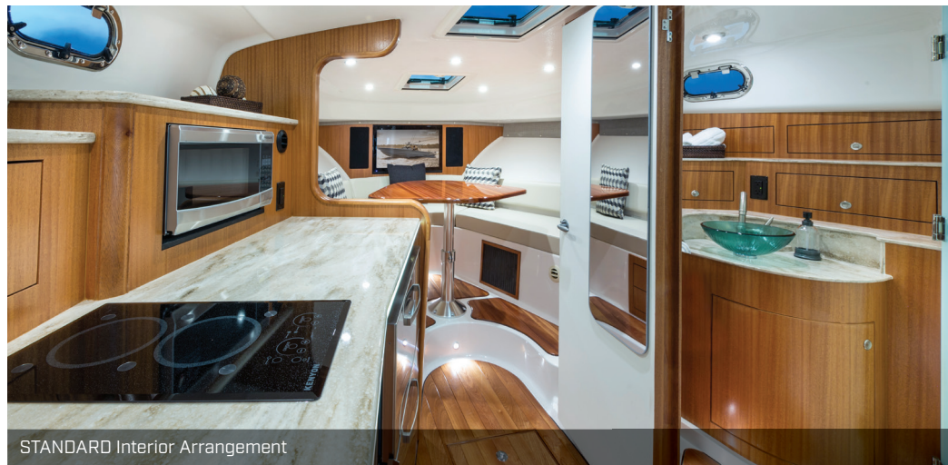
STANDARD Interior Arrangement