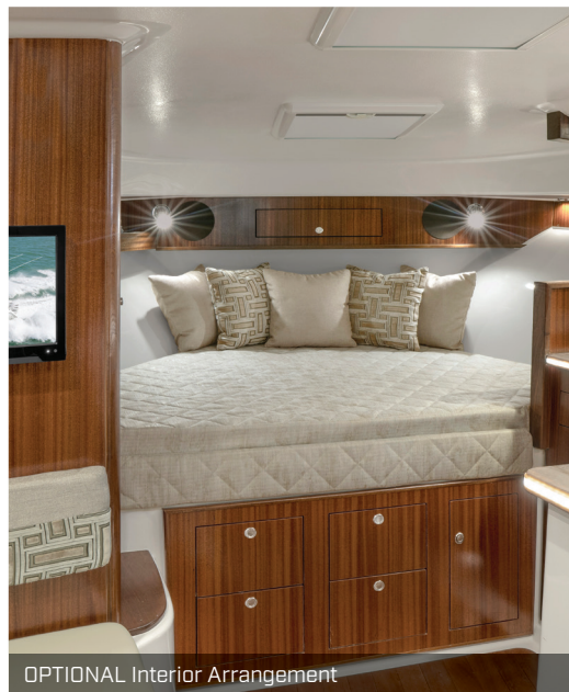
OPTIONAL Interior Arrangement