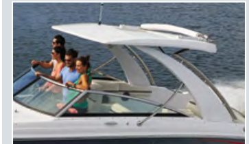
Available in black or white on models R30 and 30SC. SureShade is available in a manual pull-out or electrically deployable version.