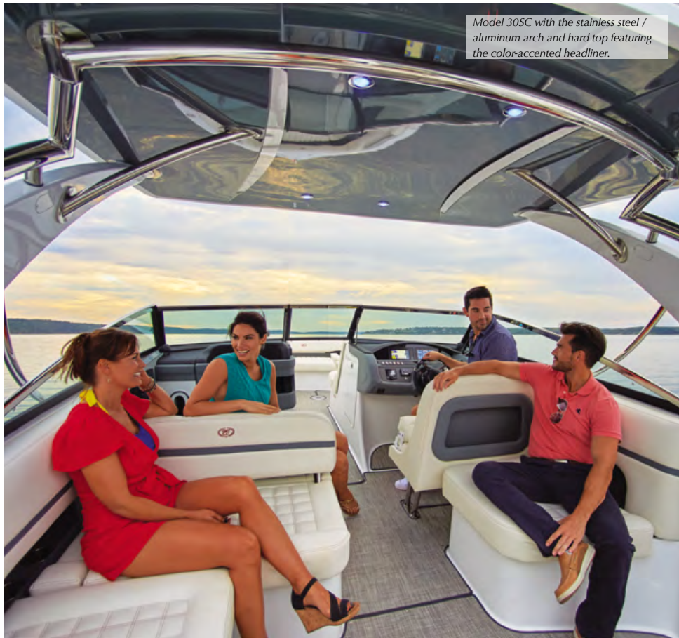
Model 30SC with the stainless steel / aluminum arch and hard top featuring the color-accented headliner.

Cobalt's selection of premium arches, tops and covers not only protect from the elements, they offer next level styling and great looks to your new boat. Arches range from aluminum tube construction with canvas biminis that easily fold down for trailering and storage, to solid structures featuring stainless steel accents and canvas sunshades or elegant hardtops.