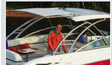
This top with an electrically deployable SureShade is standard equipment on model R35. A color-accented headliner is optional.