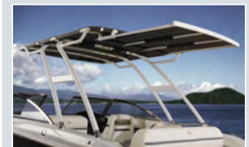
A permanent rigid structure with a stretched canvas top covering, and the extendable sunshade aft. Available for models 23SC and 25SC.